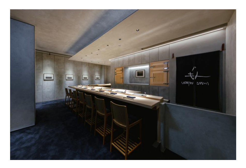
Udatsu Sushi, Hong Kong at FWD HOUSE 1881

This unique approach to a sushi dining experience continues with music being played, largely gentle jazz in the background, but with options to adjust as the evening flows. Chef Udatsu believes that music allows guests to feel more relaxed and comfortable speaking to the chef, creating an atmosphere where diners also talk to each other. Once again, one art form intertwines with another and encourages an atmosphere that differs from typical omakase dining.