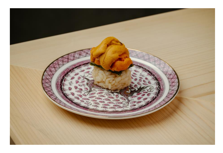
Double Sea Urchin with Seaweed Tempura

Elsewhere, a seasonal herb roll maki uses local organic herbs to envelop fish with herbs, with no rice, while a vegeroll only uses seasonal vegetables, regularly changing ingredients, that are topped with miso. This passion for the finest vegetables also reflects Udatsu Sushi's extremely rare, inclusive ability to allow vegetarian diners to enjoy a full omakase dining experience.